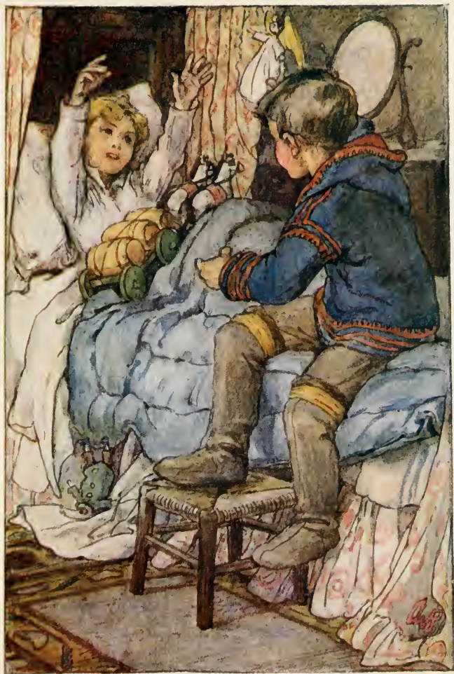
"I brought it for you" (p. 93).